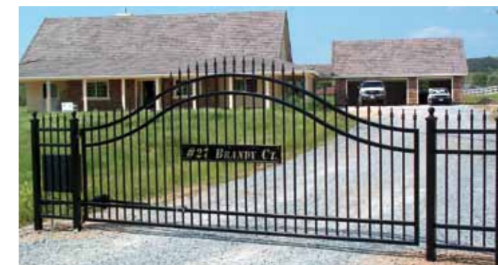
Sturdy, for swing gates up to 600 lbs and 16 ft. Great innovative functions with the new 1050 circuit board. ETL Approved.