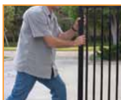
fail-safe release never be locked out (or in)