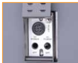
built in power switch and reset switch