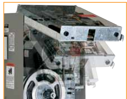
unique design allows easy access to all mechanical parts