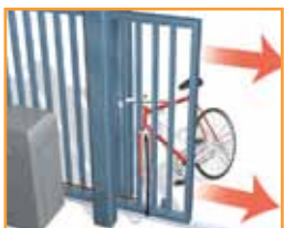
entrapment detection reverses gate when obstructed