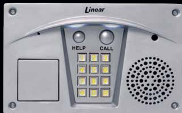
RE-2 STAINLESS STEEL